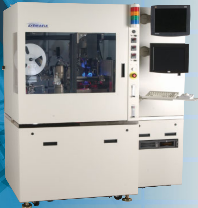
Model 1200i Tape & Reel w/Invert