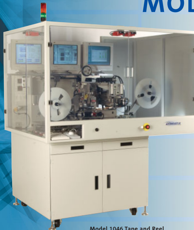
Model 1046 Tape and Reel